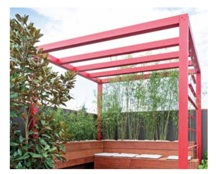
Design Ideas Ross Goodman Design